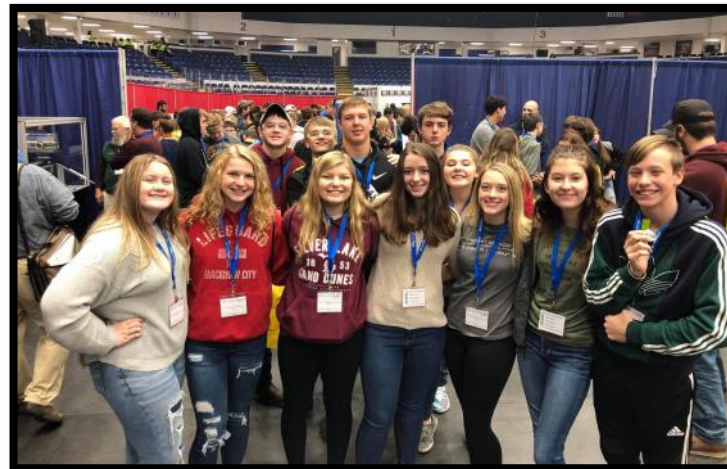
The sophomore class attended a hands-on career exploration event called MiCareer Quest. Manufacturing, Health Sciences, Business, and the Human Service industries were all represented.

*Exact dates for 7th and 8th grade M-Step will be availa- ble in February.