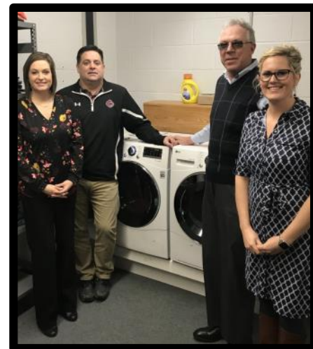
Social and Emotional Committee Members:

Cass City Jr./Sr. High School as well as the social and emotional committee would like to extend their sincere appreciation and gratitude to the Pinney Foundation. Through this special grant, the social and emotional committee was able to purchase a washer and dryer. These appliances will be used to wash donated items for our clothing closet as well as provide students the opportunity to bring in their own clothes to wash.