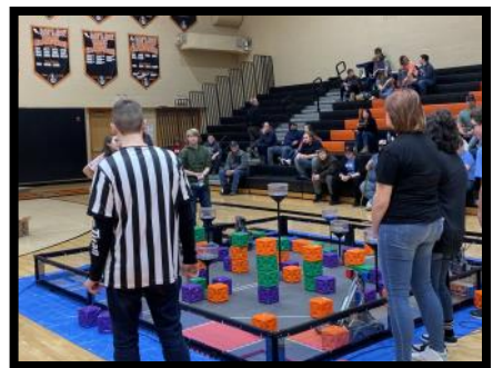
Right: The junior high students work hard in state qualifying robotics meet.

The Robohawks VEX Robotics teams are nearing the end of another successful season of competition in the 2019-2020 VEX Tower Takeover Challenge. A total of 10 teams in grades 7-12 have been working hard and so far, they have had 1 high school team qualify for the State Championship at Jenison Field at Michigan State University. This competition will take place on February 23rd. In addition to the high school team, one junior high team qualified for the Middle School State Championship at Monroe County Community College on March 7. The last regular season competition is a large home invitational at Cass City Jr./Sr. High School starting at 9:30am on February 1st.